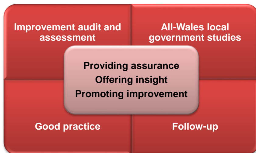
Exhibit 4: Components of my performance audit work